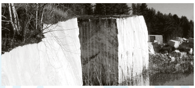
Marble quarry near Tweed.

There are some interesting geological structures visible in the Tweed area, including pegmatite dikes. These cross-cutting intrusive bodies, emplaced after a rock has solidified, are veins filled with a variety of large mineral crystals. Of special interest is an unconformity, located northeast of the town. An unconformity is a surface between successive rocks layers that represents a missing interval in the geologic record. In this case, the contact is between Precambrian granite and Ordovician limestone (490 – 443 million years ago).